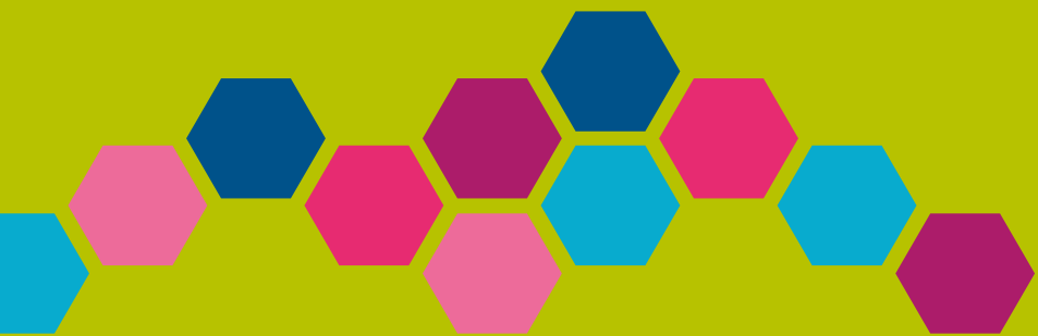
Word search answers.